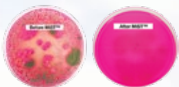
Porsche equipped with Cabin Air Filter 29,000 km / 18,000 miles