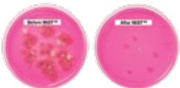
Toyota Corolla without Cabin Air Filter 198,000 km / 123,000 miles